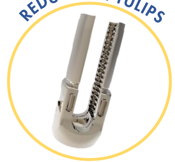
TRIPLE LEAD THREAD