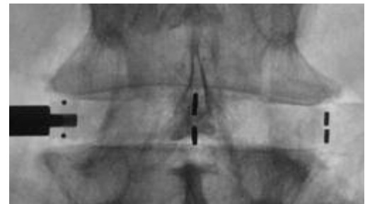
6 Tantalum Markers Increases Visualization of Implant Position